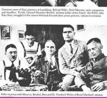
Hitler in prison with Maurice, Kriebel, Hess and Dr. Friedrich Weber of Bund Oberland, 1933.