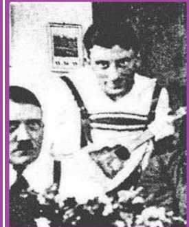
All of Hitler's bodyguards and closest friends were homosexuals: