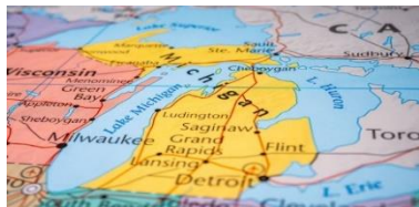
#1: Clerk decries 'tyranny' after Michigan strips her of running election

https://www.bridgemi.com/michigan-government/clerk-decries-tyranny-after-michigan-strips-her-running-election