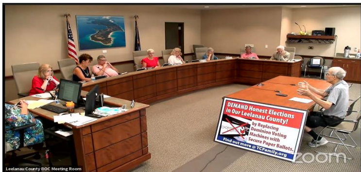
Six Leelanau County Residents request replacing Dominion "Black Box" Voting Machines with secure paper ballots: