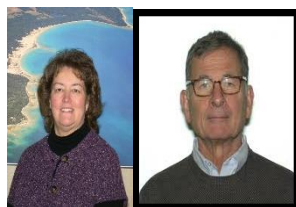
Two Leelanau County Residents speak in support of Dominion "Black Box" Voting Machines:

https://www.youtube.com/watch?v=2bTWA2x6KaE&t=8134s