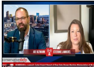
#2: 2022-07-18 BOMBSHELL New LawsUIT: Cyber Expert Report of Raw Data Shows Machine Manipulation of MI 2020 Election [Excerpts]